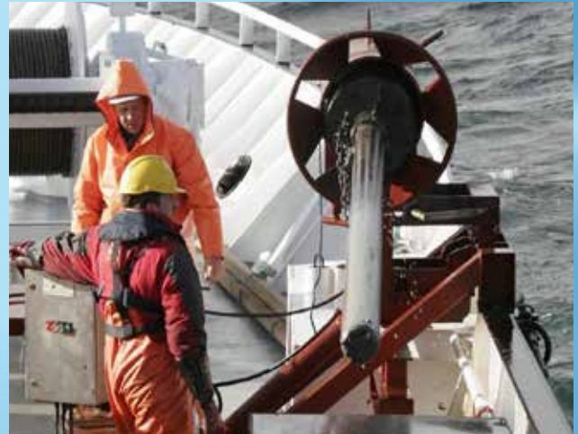
Gravity corer brought onboard

For all the surveys the vessel has been equipped with a hydraulic corer bell, making the coring safe even in rough weather, up to gale force. When operating with such a system, the core barrels can be up to 6 m.