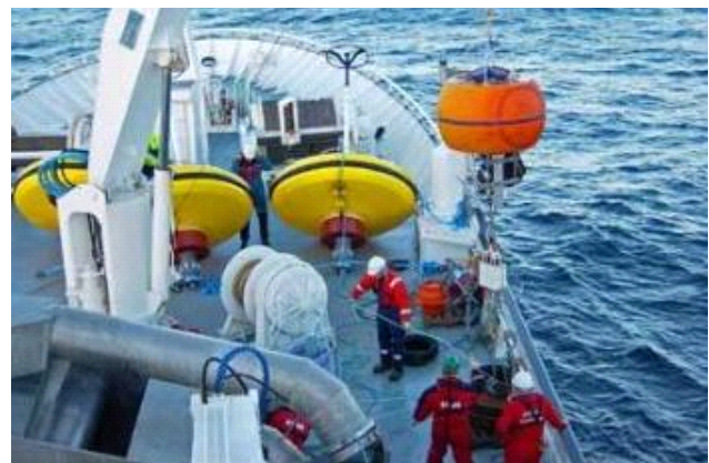
Weather buoy being deployed

MV Elisabeth has been used regarding deploying and retrieval of large weather buoys since 2005 at water depth up to 1200m using the different deck cranes onboard.