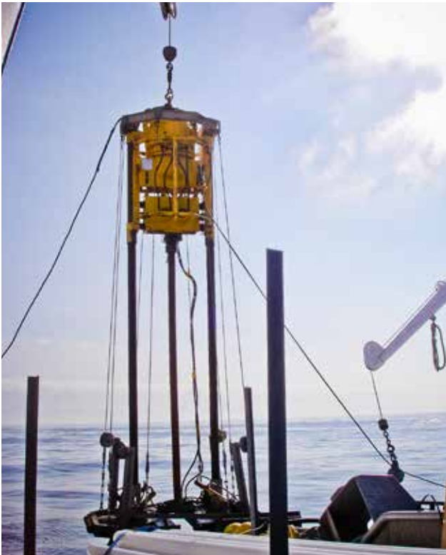
Vibro corer being launched from MV Elisabeth

Vibro coring surveys have been undertaken since 2007. For all the vibro coring surveys a hydraulic vibro corer has been used. The vibro corer is standing vertically on a platform on the deck and being lifted over the gunwale using a crane when in position. Core barrels up to 4.5 m can be used. With this equipment samples have been collected at up to 650m water depth, but the equipment can be used down to 900m. It is also possible to use other types of vibro corers from MV Elisabeth.