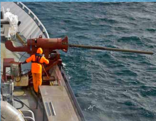
Gravity corer being made ready for deployment

MV Elisabeth has been used for gravity coring since 2007 in water depths to below 2000 m. With gravity coring the corer is lowered by the winch at top speed down to 50 – 100 m above the sea bed. The vessel is then moved, if necessary, so that the corer is within the target, and then lowered again at top speed on the winch into the sea bed, thus collecting the core which is then winched back onboard. For some surveys special coring winches have been utilised while on other surveys the winches normally used for the purse seining have been used. Depending on what is required the winch speed can be from 50 to 200 m/min.