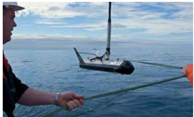
Deployment of side scan sonar

Side scan sonar has been used on “Elisabeth” since 2007. The system is used from the back deck where the “fish” is launched using the crane on the back deck. Side scan sonar has been operated down to a depth of 1300 m.