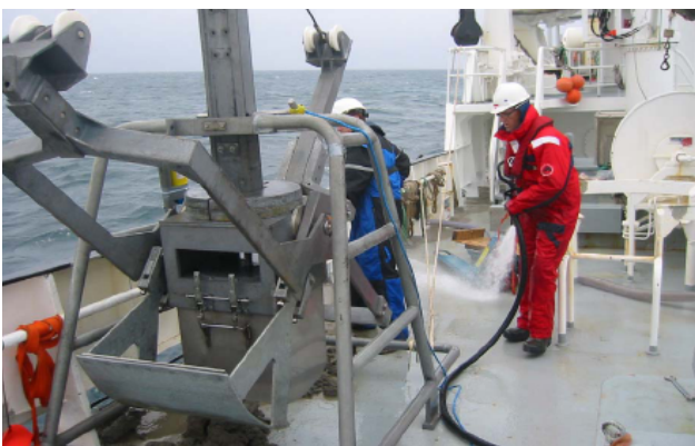
Box corer being landed on the deck of MV Elisabeth

Box coring is normally used for collection of sea bed samples for environmental analyses. Such samples have been collected from MV Elisabeth since 2007 using different types of box corers at water depths from 50m to 1300m. The deck crane is used for lifting the box corer in and out from the deck, while the coring winch